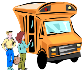
Pupil Transportation Operation and Safety Rules – July 2012